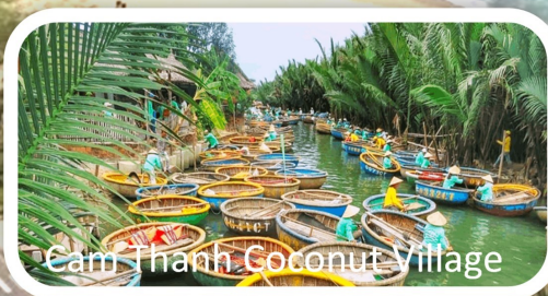
Cam Thanh Coconut Village