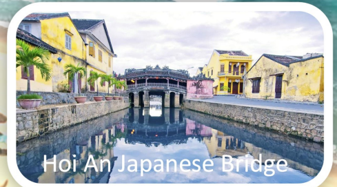
Hoi An Japanese Bridge

Contact us: Dzulkifli Hj. Kintan - 9622 7295, Hamimah - 8434 6955