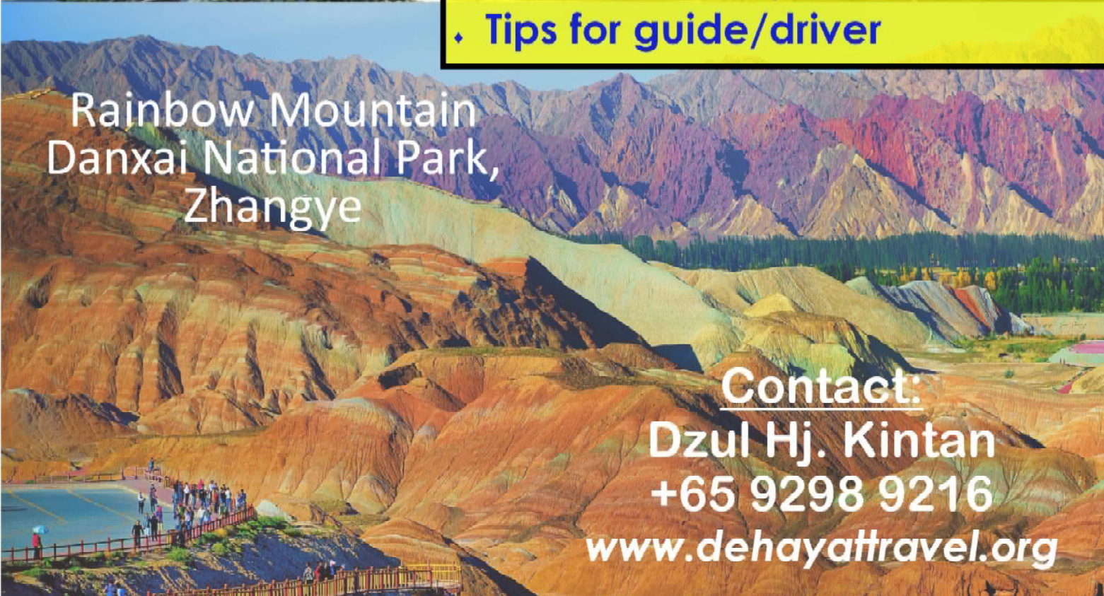
Rainbow Mountain Danxai National Park, Zhangye