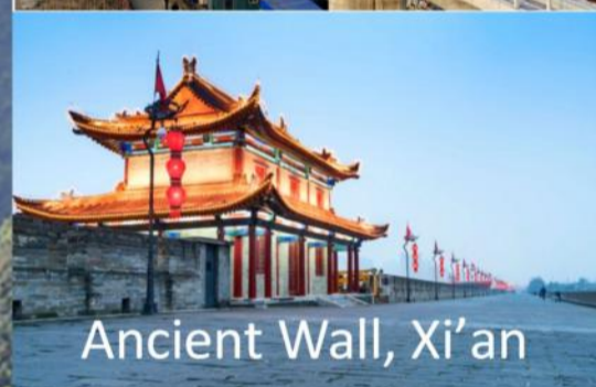
Ancient Wall, Xi'an