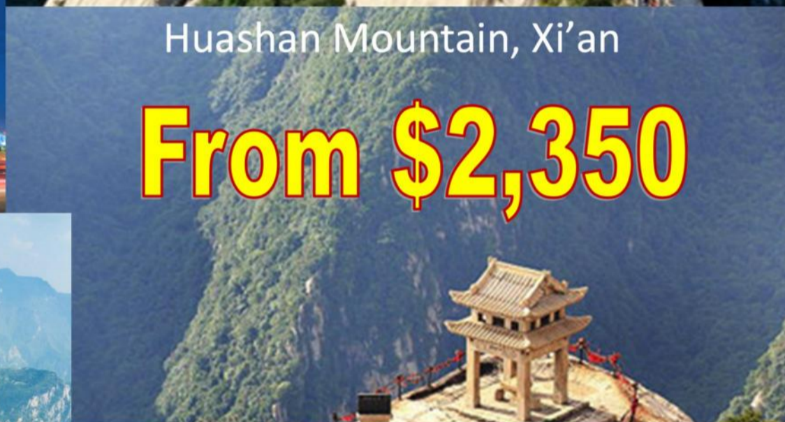
Huashan Mountain, Xi'an