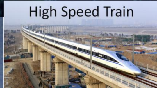
High Speed Train